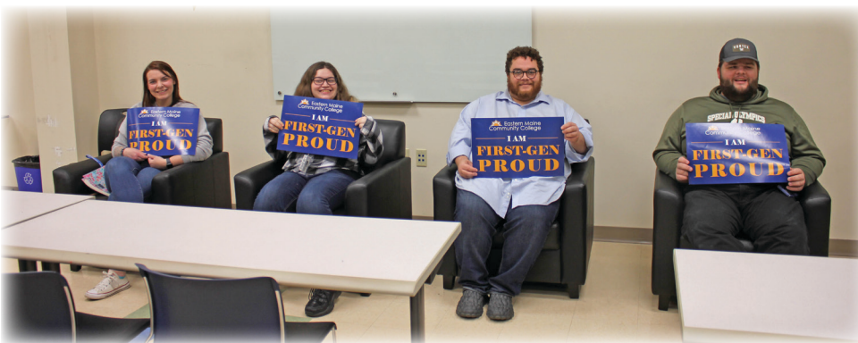
SSS students from EMCC celebrating First-Gen day and grant-aid recipients !